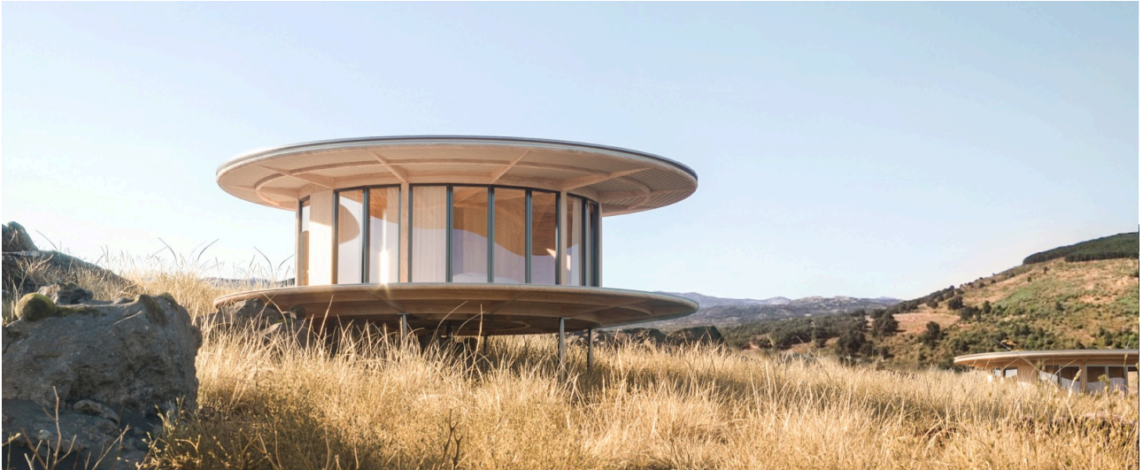
ECHO on site — comfort tuned to its landscape, delivered from a standardised kit-of-parts.

From reading a site to installing a finished structure, BYLD carries a hospitality project across every stage — as one accountable partner rather than a chain of hand-offs.